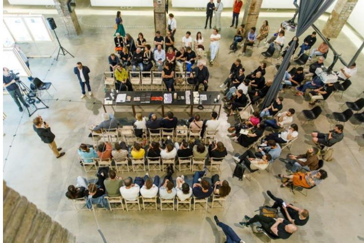
CCP07 Connection at Muhba Oliva Artés

The exhibition is structured in two complementary layers. The first functions as an archive that gathers the 348 projects presented in the different editions of the project, with the original panels reproduced in miniature and organized chronologically by cities, as they were originally exhibited, now forming a timeline. The second presents a selection of 202 recent projects, organized into five thematic islands that offer a transversal reading of the architectures transforming European cities.