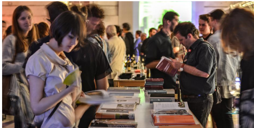
CCP01 Connection at AAAB

The exhibition is structured in two complementary layers. The first functions as an archive that gathers the 348 projects presented in the different editions of the project, with the original panels reproduced in miniature and organized chronologically by cities, as they were originally exhibited, now forming a timeline. The second presents a selection of 202 recent projects, organized into five thematic islands that offer a transversal reading of the architectures transforming European cities.